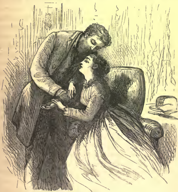
"ONE HAPPY MOMENT."

"Poor Christie, it's hard that you should go away